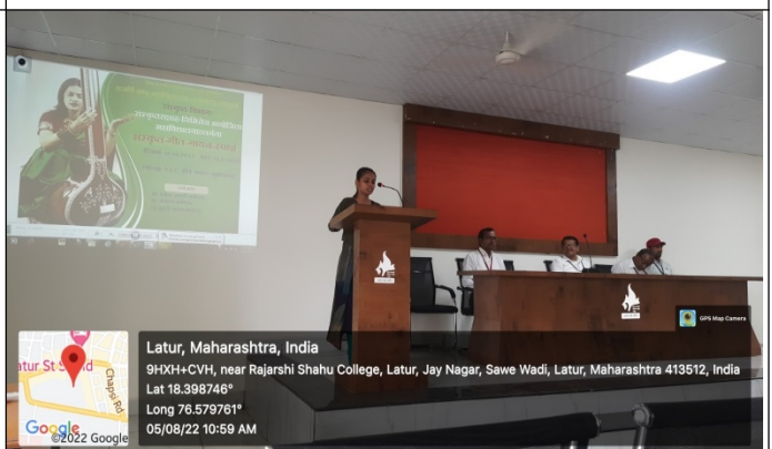
Students presenting a Sanskrit Shotra during the Competition

Latur, Maharashtra, India 9HXH+CVH, near Rajarshi Shahu College, Latur, Jay Nagar, Sawe Wadi, Latur, Maharashtra 413512, India Lat 18.398746° Long 76.579761° 05/08/22 10:59 AM