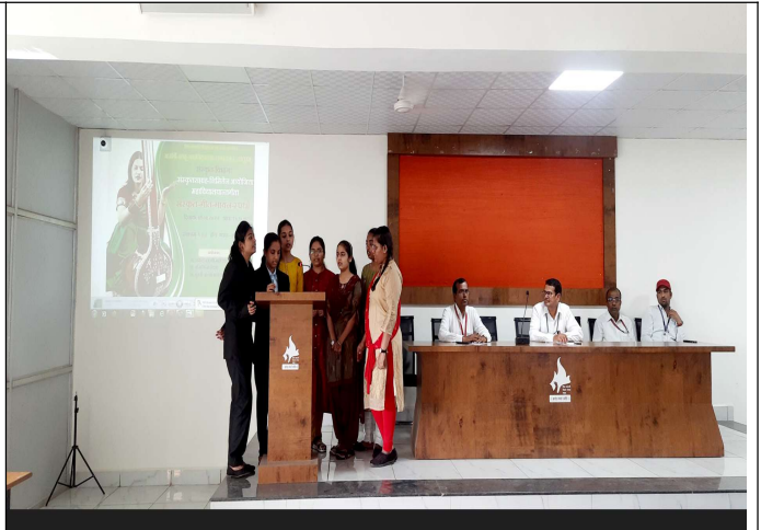
Students presenting a Sanskrit Song during the Competition.