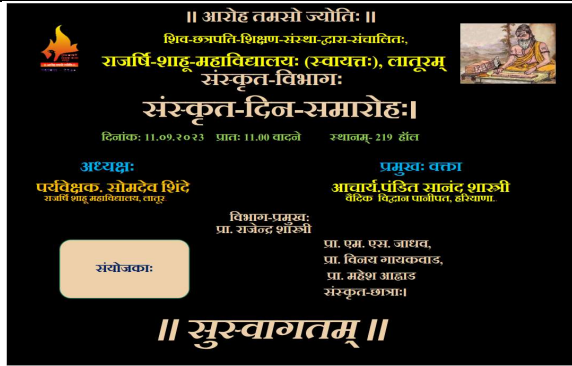
Brochure Prepared for the Programme