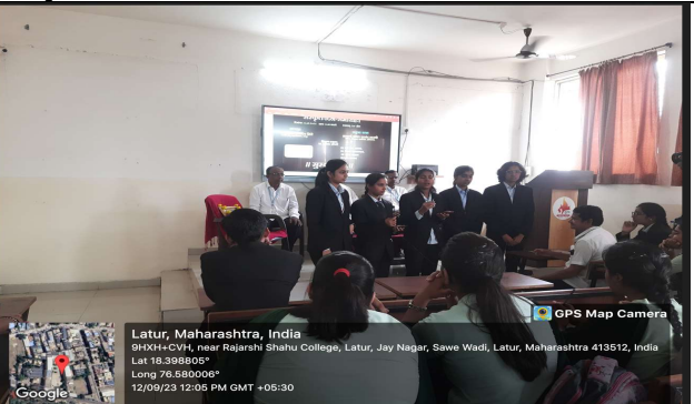
Students presenting a Sanskrit song during the Program.