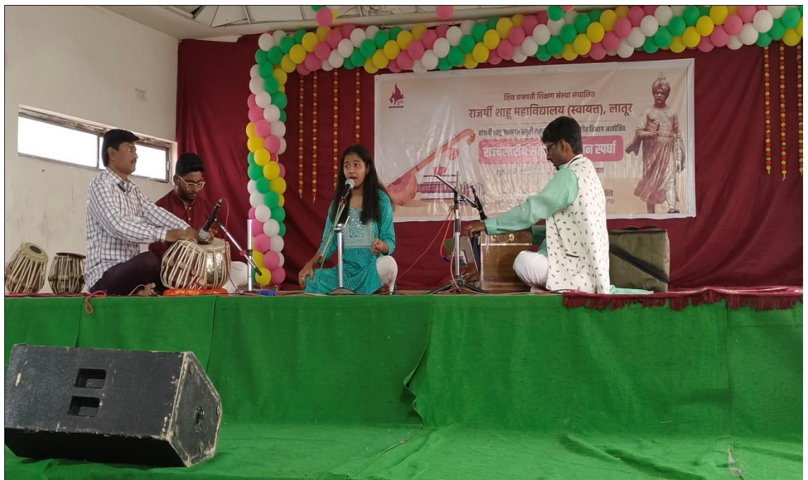
contestants performed song in this competition