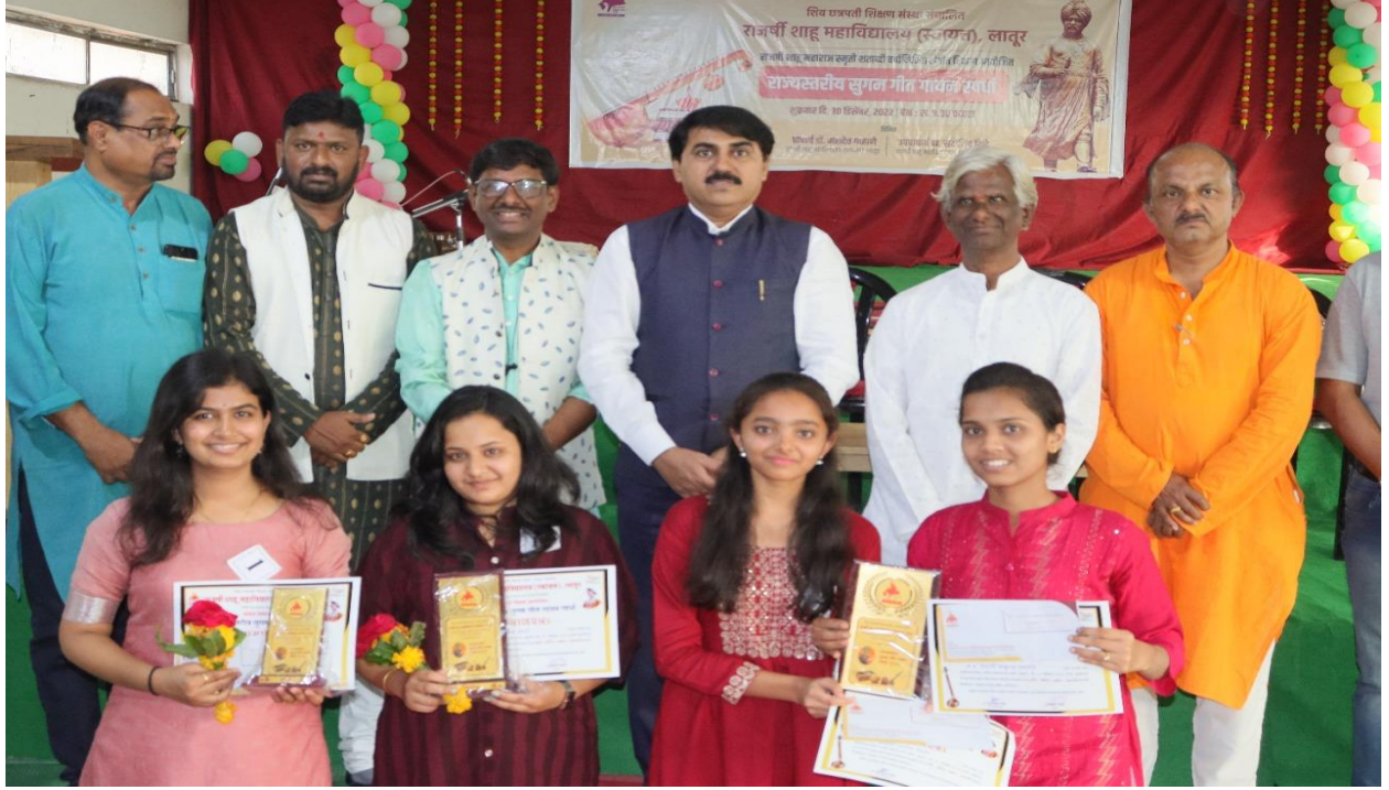
All dignitaries with the winning contestants