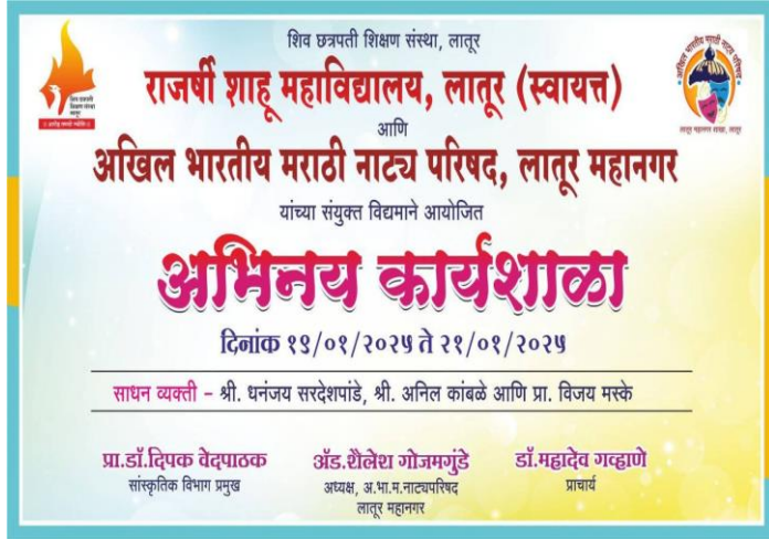
Acting Workshop Poster