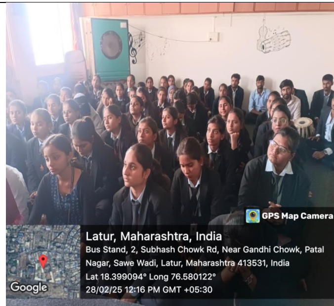
Students Present For The Program.