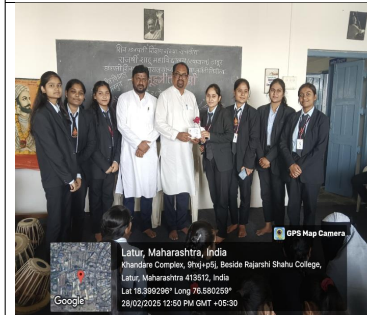
Prizes distribution ceremony