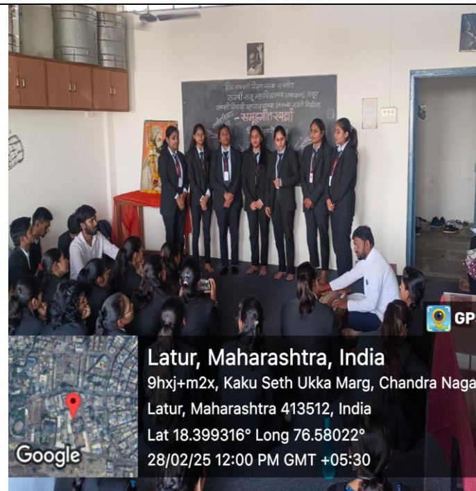
Students of the music department performance by the Group Song.