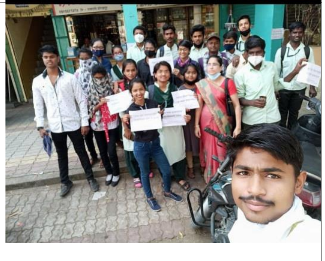
Students making the people aware about the eradication of plastic