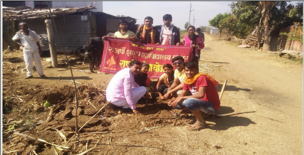
NSS VOLUNTEER PARTICIPATED IN ENVIRONMENTAL CONSERVATION