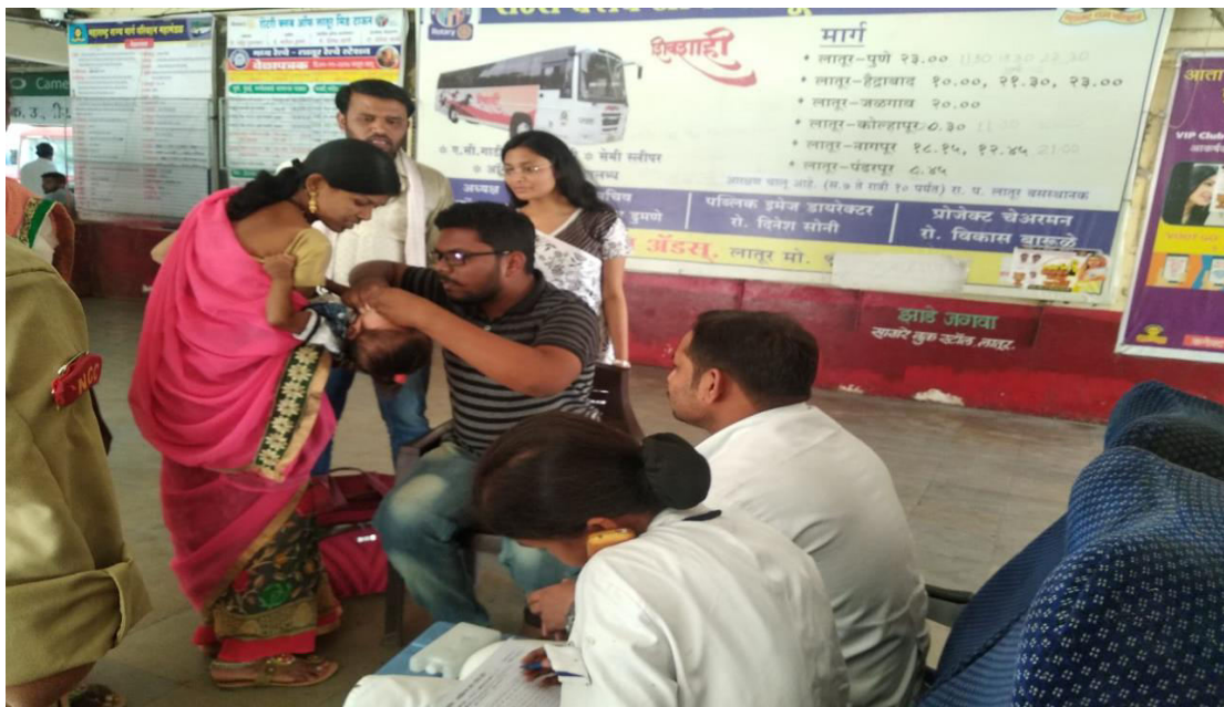
Students participated in the Pulse Polio Awareness Program