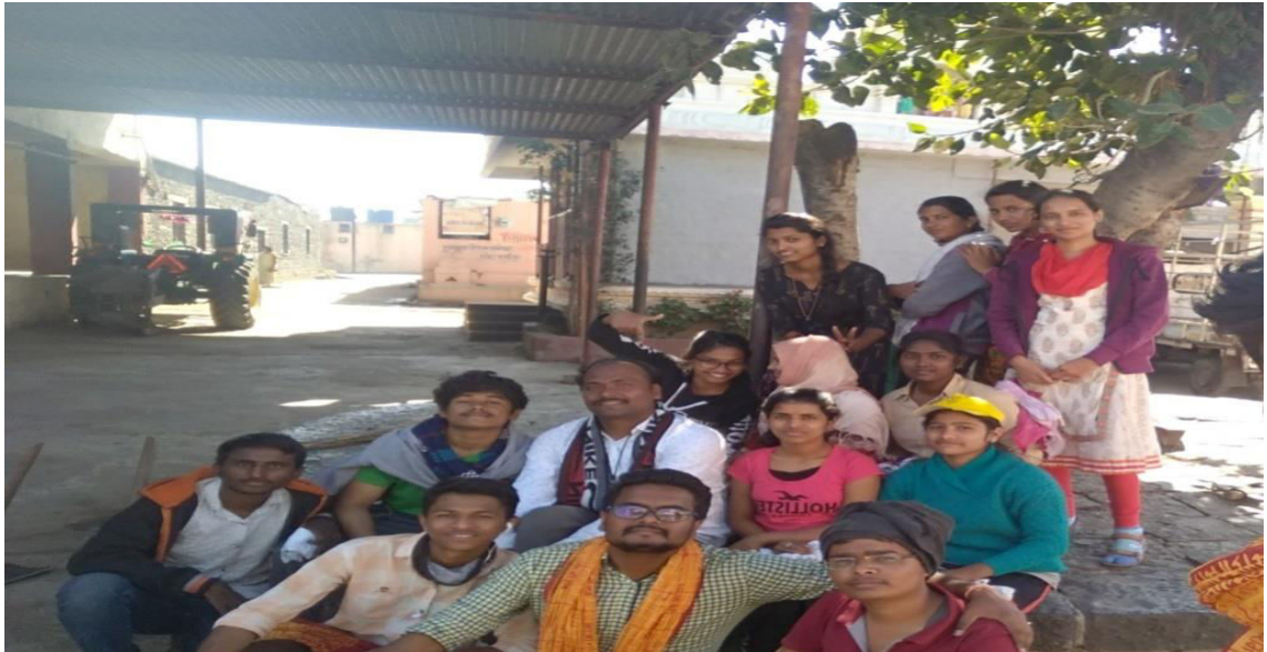
Students participated in the Pulse Polio Awareness Program