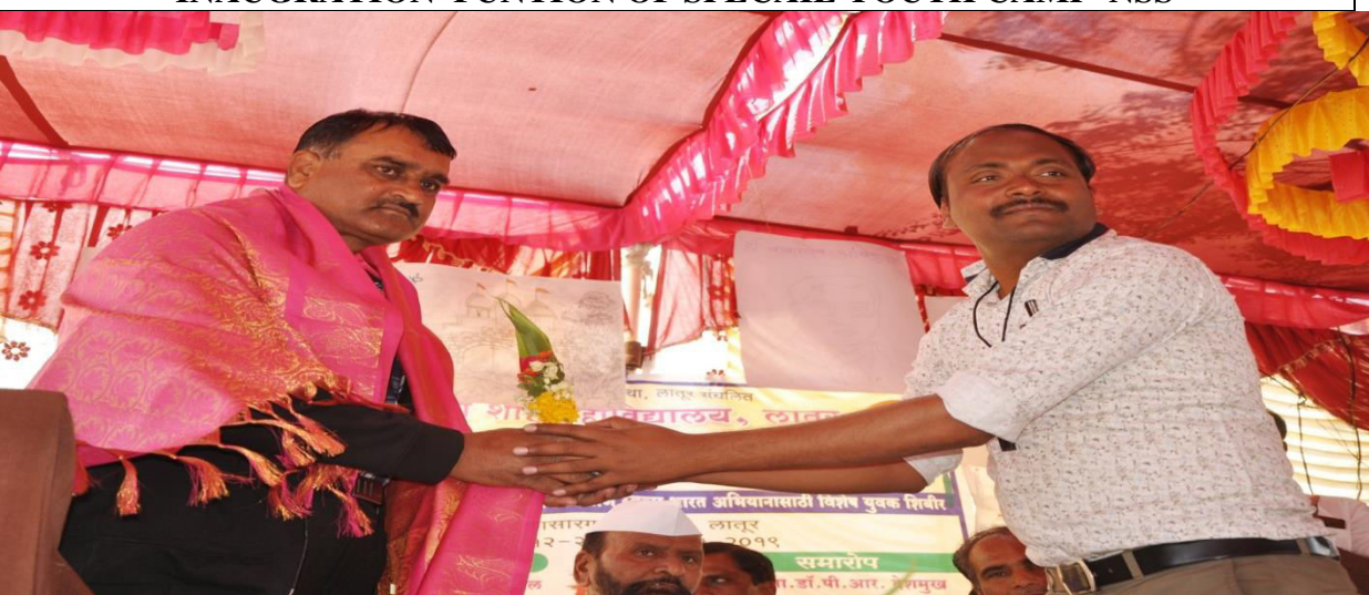
FALICITATION OF SAYYED SIR