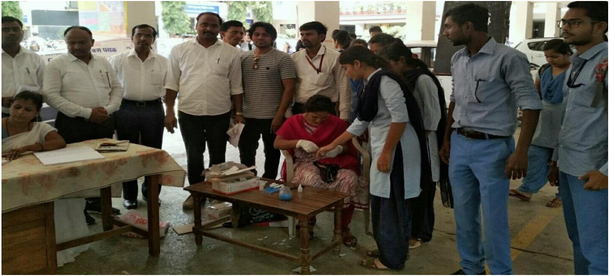
NSS Volunteer while giving sample for HIV Antigen Test