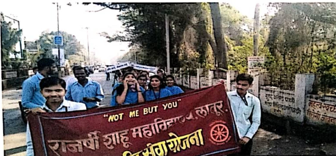
Nss Volunnters Participated In Road Safety Rally On occasion of 31 st Road safety Program