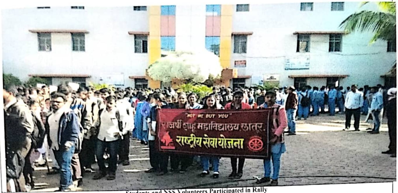
Students and NSS Volunteers Participated in Rally