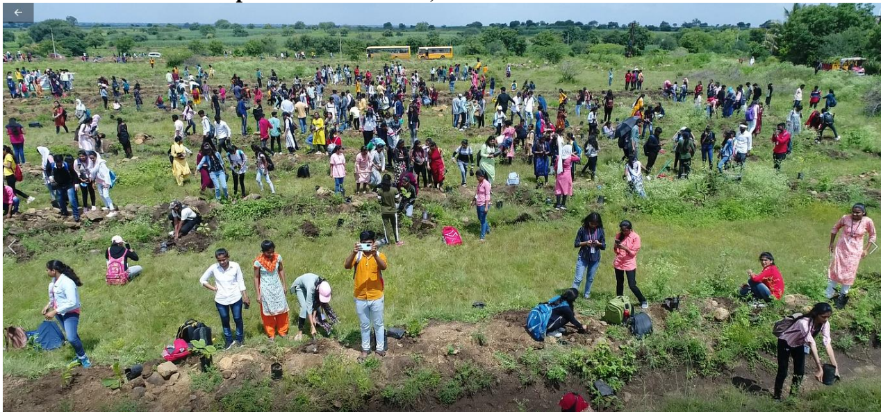
Field View of field Through Camera while tree plantation by students