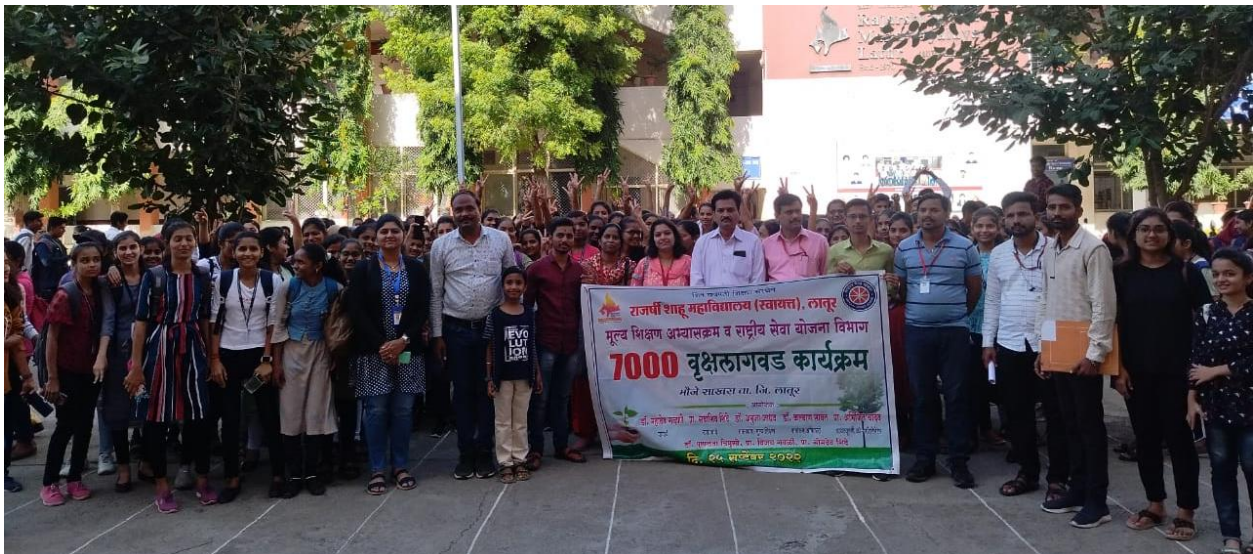
Group Photo at the time of Departure from College premises to Sakhara