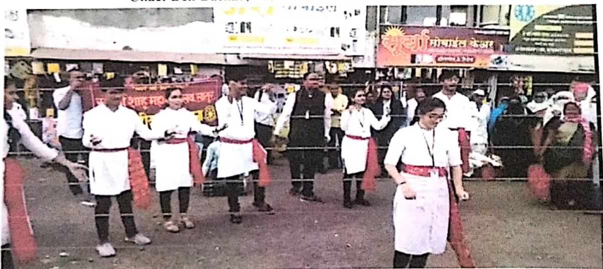
NSS Volunteers Presenting street play for Awareness about Education of Girls and female feticide Under Beti-Bachao, Beti-Padhao at Ramjanpur