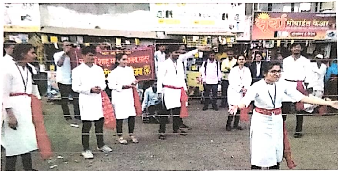
NSS Volunteers Presenting Street Play Awareness about Education of Girls and female feticide Under Beti-Bachao, Beti-Padhao at S.T. Bus Stand Latur