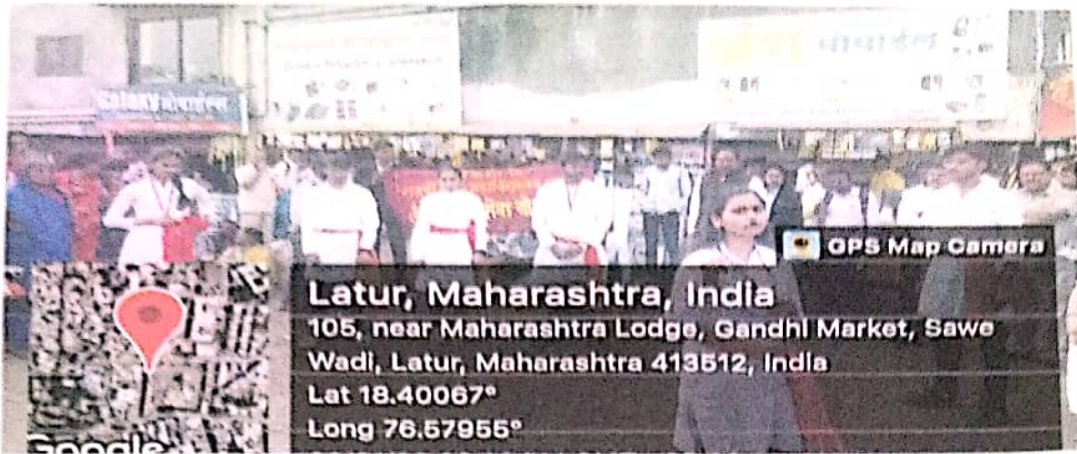
NSS Volunteers Presenting Street Play Awareness about Education of Girls and female feticide Under Beti-Bachao, Beti-Padhao at S.T. Bus Stand Latur