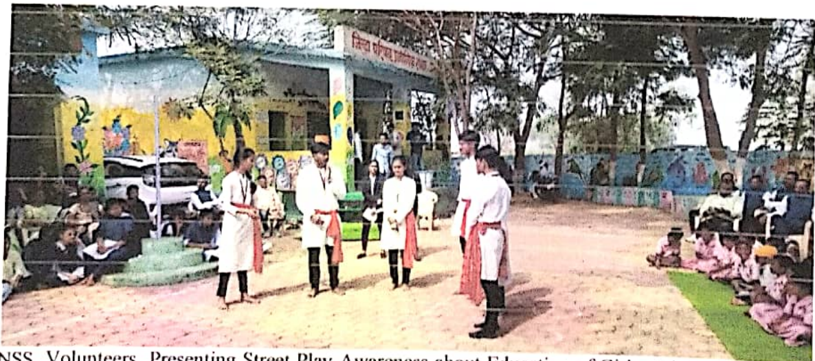
NSS Volunteers Presenting Street Play Awareness about Education of Girls and female feticide Under Beti-Bachao, Beti-Padhao