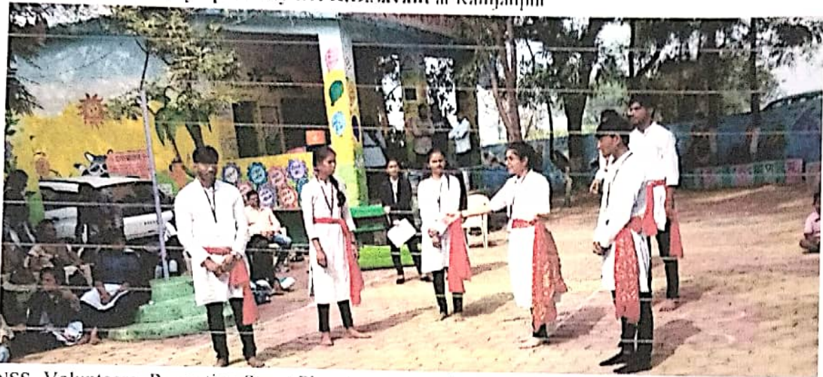
NSS Volunteers Presenting Street Play Awareness about Education of Girls and female feticide Under Beti-Bachao, Beti-Padhao