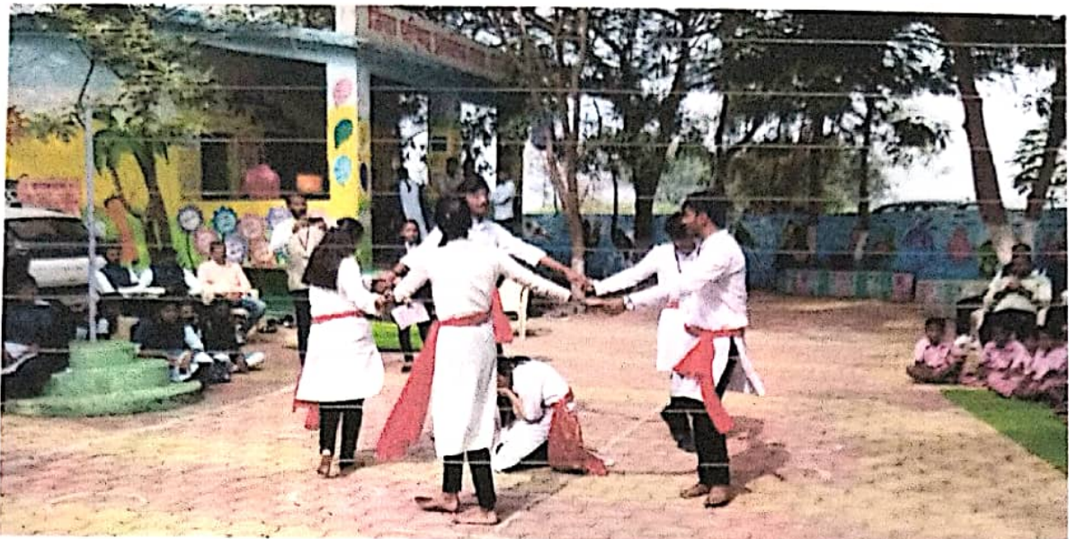
NSS Volunteers Presenting street play for Awareness about Education of Girls and female feticide Under Beti-Bachao, Beti-Padhao at Ramjanpur