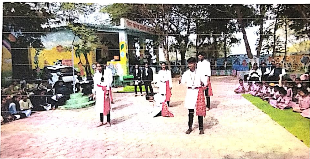
NSS Volunteers Presenting street play for Awareness about Education of Girls and female feticide Under Beti-Bachao, Beti-Padhao, at Ramjanpur

D) Link of Video of the programme if any (Video may be uploaded on college website/ YouTube, etc.)