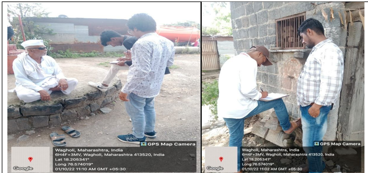
Students Participated in House Hold Survey in Wagholi