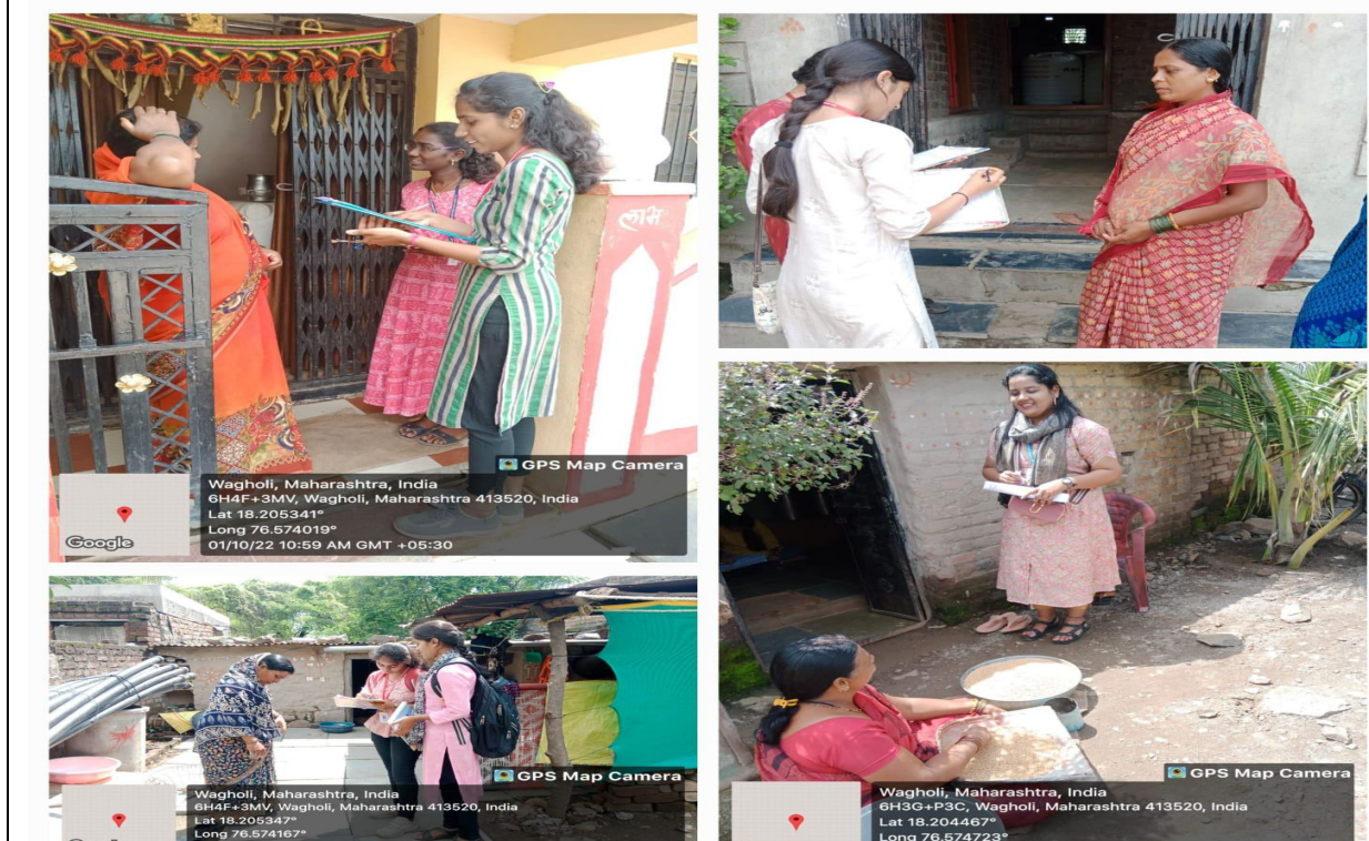
Students Participated in House Hold Survey in Wagholi