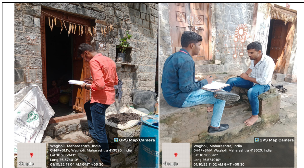
Students Participated in House Hold Survey in Wagholi