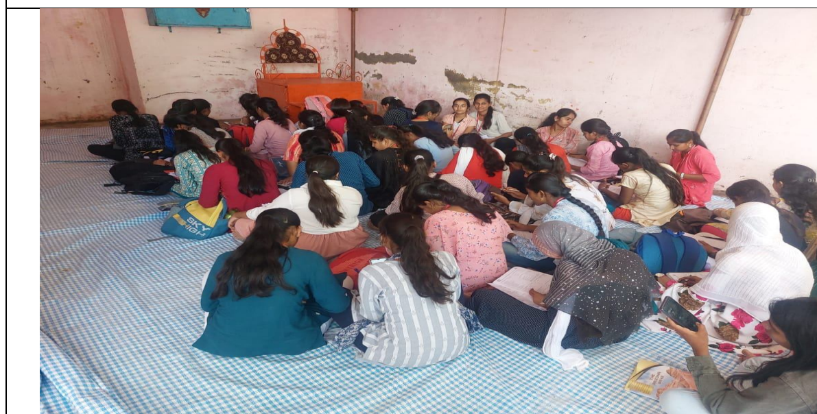
Students Participated in House Hold Survey in Wagholi