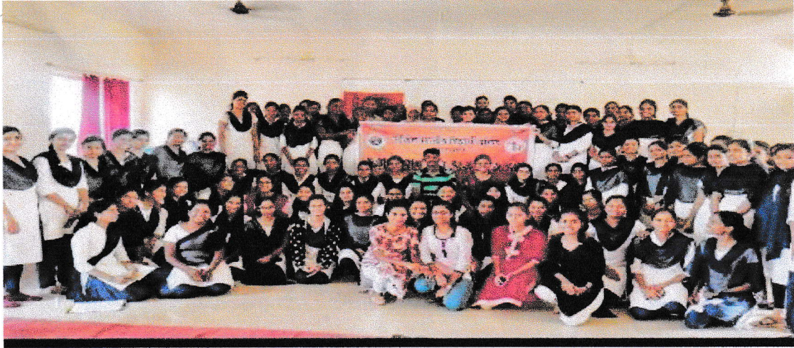
Student Participants of the program ABVP Shourya Prashikshan.