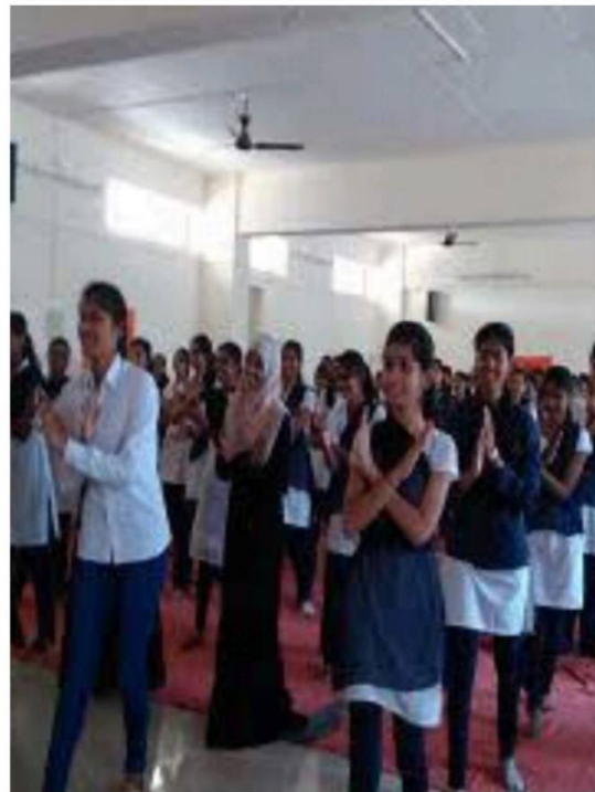
Student Participants during Shourya Prashikshan.