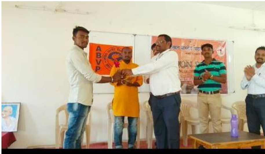
Inauguration of ABVP Shourya Prashikshan for Women at Department of Biotechnology,