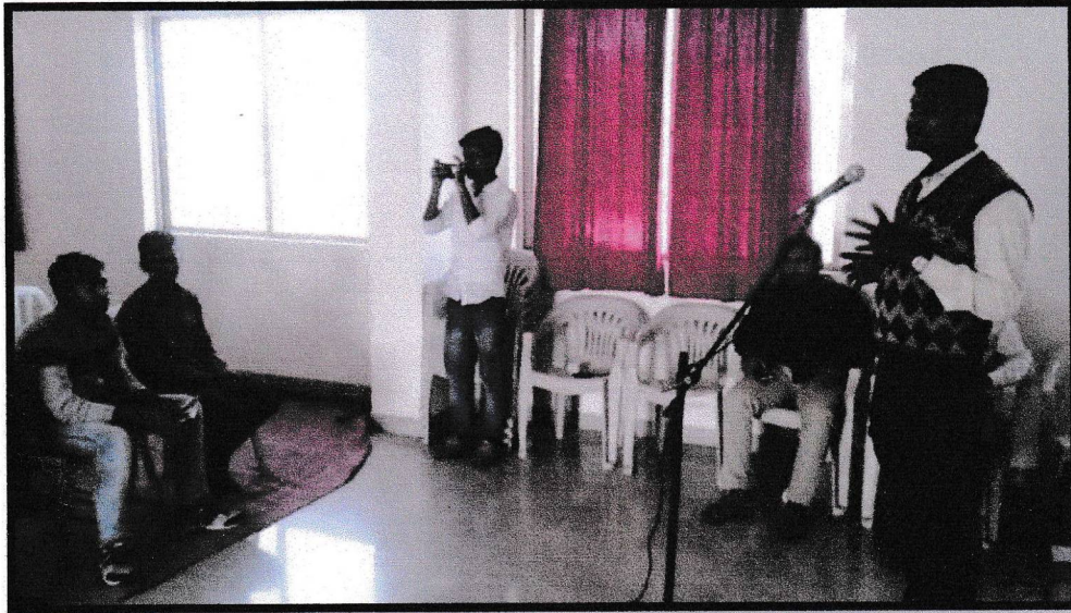
One of the staff of Dr. K. D. Shendge Jr. College, Omerga expressing their views about visit to our Department.