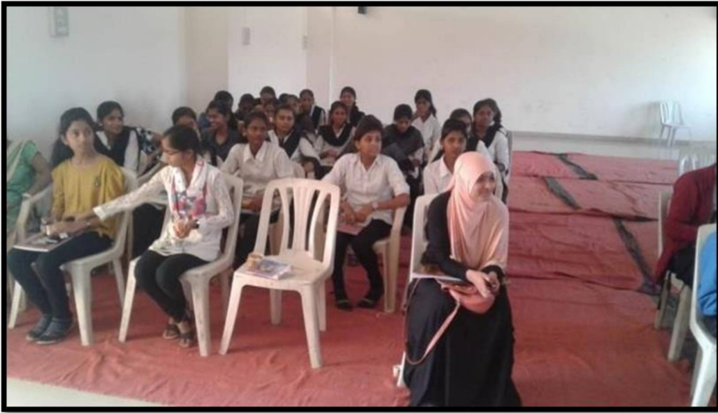
Student participants of Dr. K. D. Shendge Jr. College, Omerga