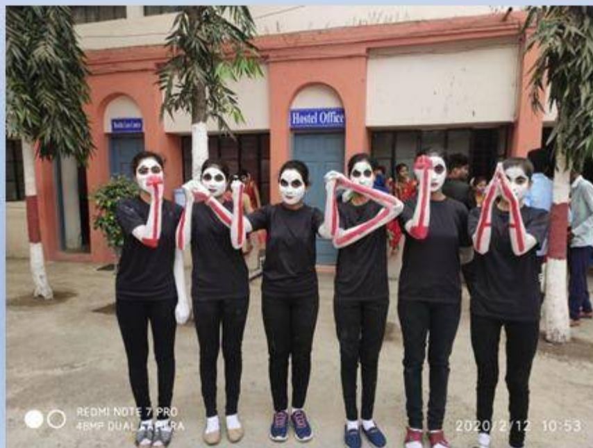
Play on "STOP Abuse of Women"

Students of Biotechnology performing mime on Stop Abuse of Women.