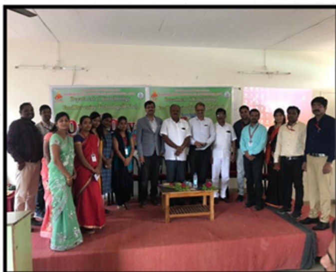
Inauguration Ceremony of Open house organized by department of Biotechnology and Food Processing Technology.