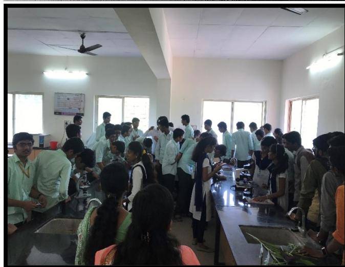
Students actively Participated in open house celebration. organized by department of Biotechnology and Food Processing Technology.