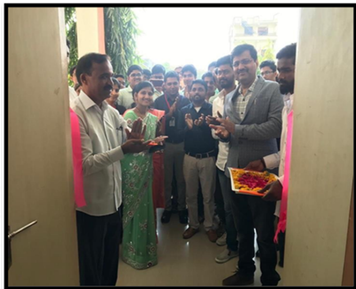
Inauguration Ceremony of World food day Celebration organized by department of Biotechnology and Food Processing Technology.