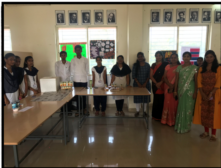
Students actively participate in World food day Celebration organized by department of Biotechnology and Food Processing Technology.