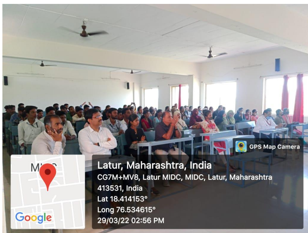
Participants attending the Hands on Training Program on Plant Tissue Culture