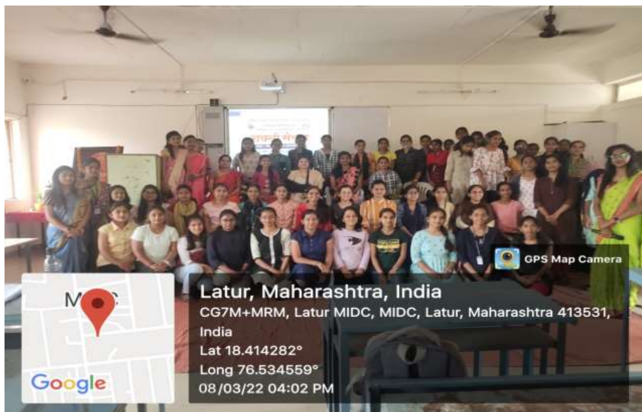
Celebration Of International Women's Day by guests, all female students and female teachers of Dept. of Biotechnology and Food Processing Technology, Rajarshi Shahu Mahavidyalaya (Autonomous), Latur.