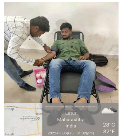
Participation of students in Blood Donation camp.