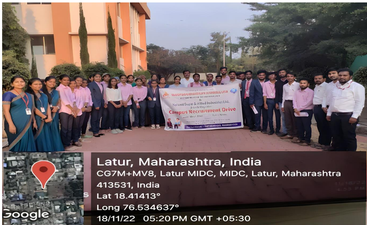
Participated candidates for Campus Recruitment Drive interview which was organized on 18 November, 2022