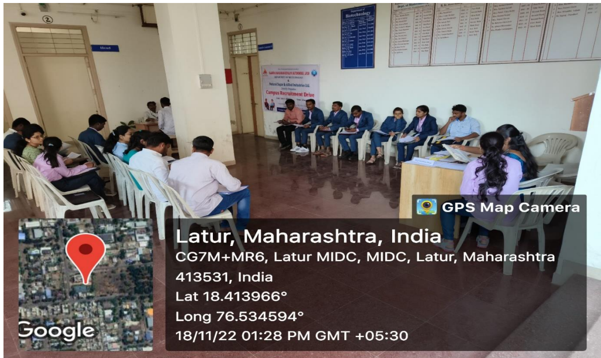
Candidates participation for interview for Campus Recruitment Drive held on 18 th November, 2022.