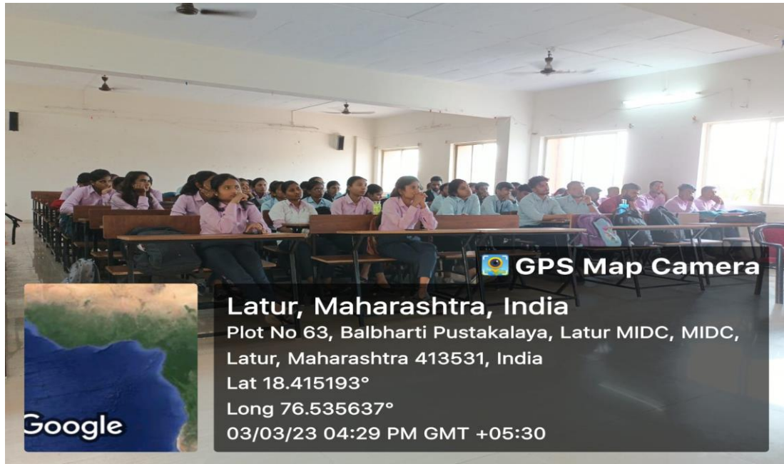
Student Participants in one week workshop on Financial Education for Young Citizen