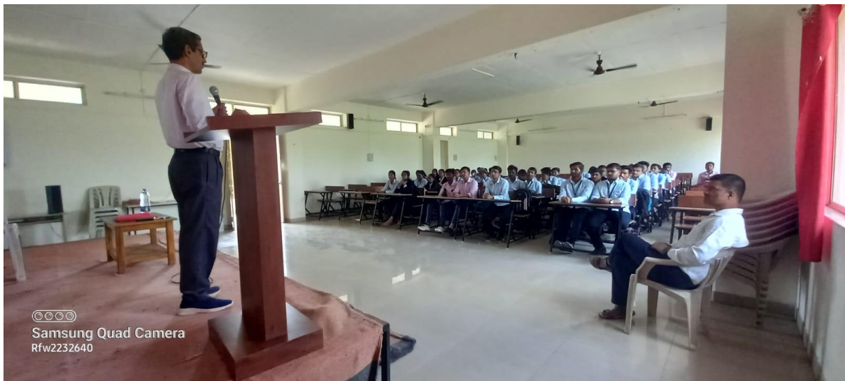
Student Participants attending the Workshop