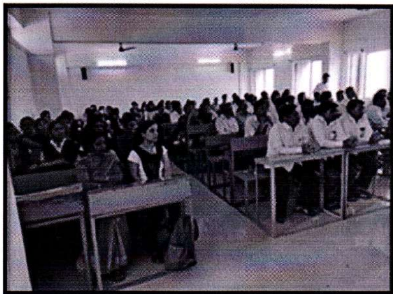
Parents and faculty members attending the Parent-Teacher Interaction Meeting for PG First Year Students, Department of Biotechnology.