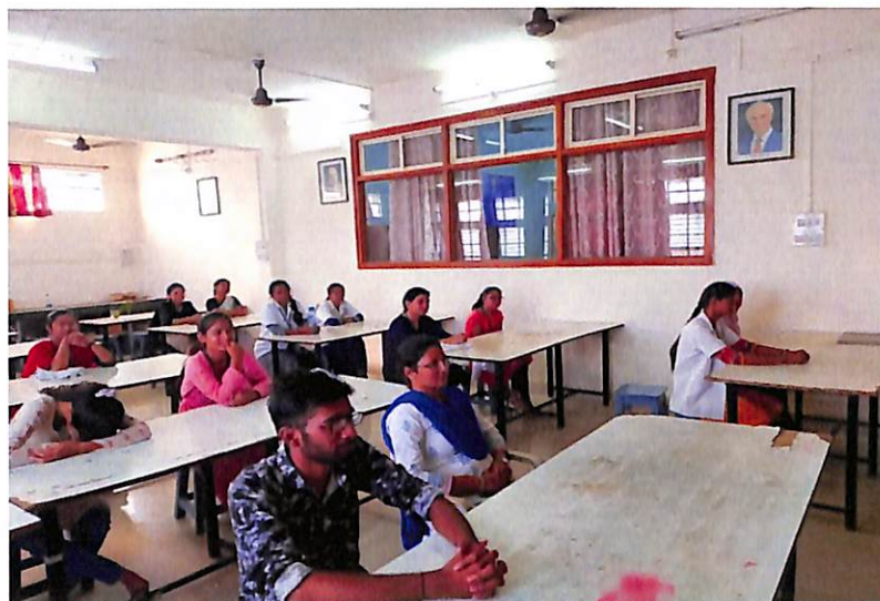
Students of UG and PG attending the Programme of Birth Anniversary of Robert Endre Tarjan.