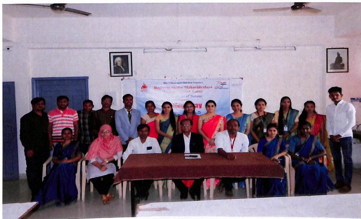
Faculties of Department and Faculties of College Day-1, 2022.