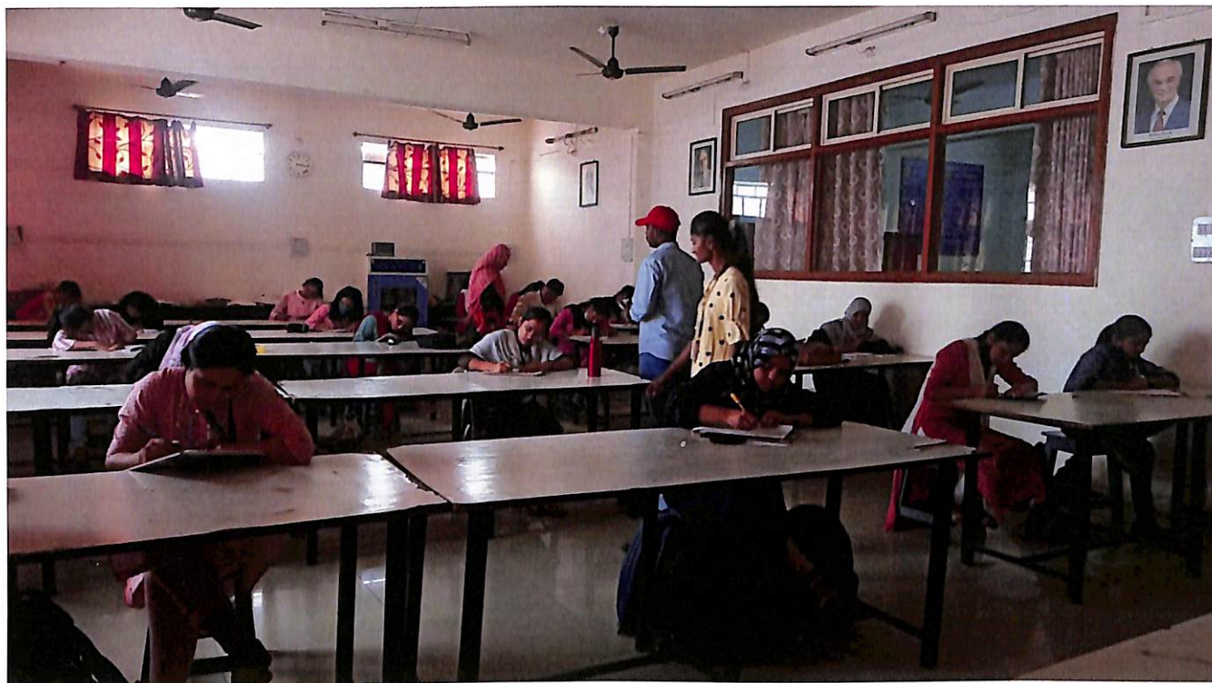
Participants of Essay Writing Competition 08.03.2022