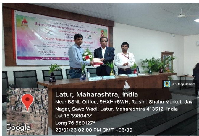
Felicitation of Chief Guest