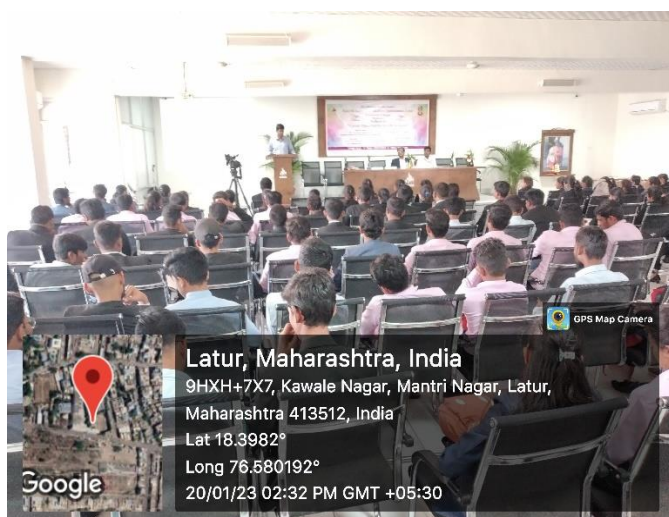
Participants involved in programme