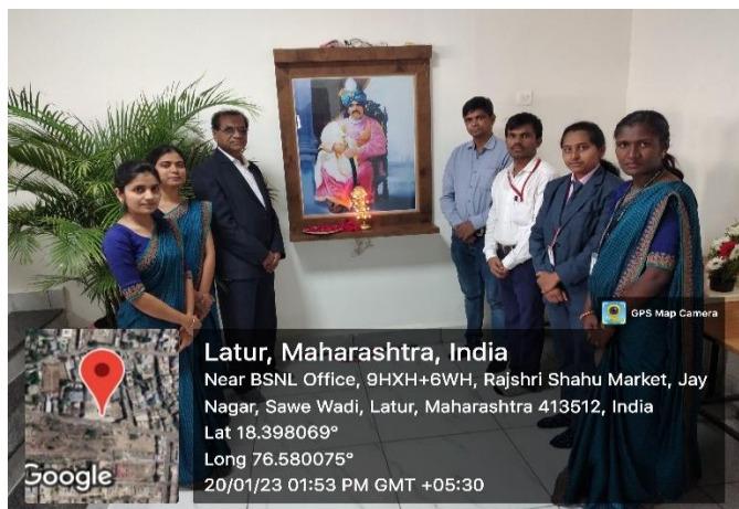
Inauguration of the Programme by lighting lamp