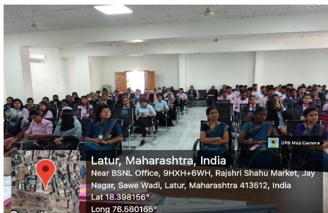
Participants involved in programme

D) Link of Video of the programme: - https://www.youtube.com/live/da7gGALxrV4?feature=share