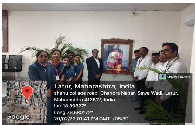
Inauguration of Programme