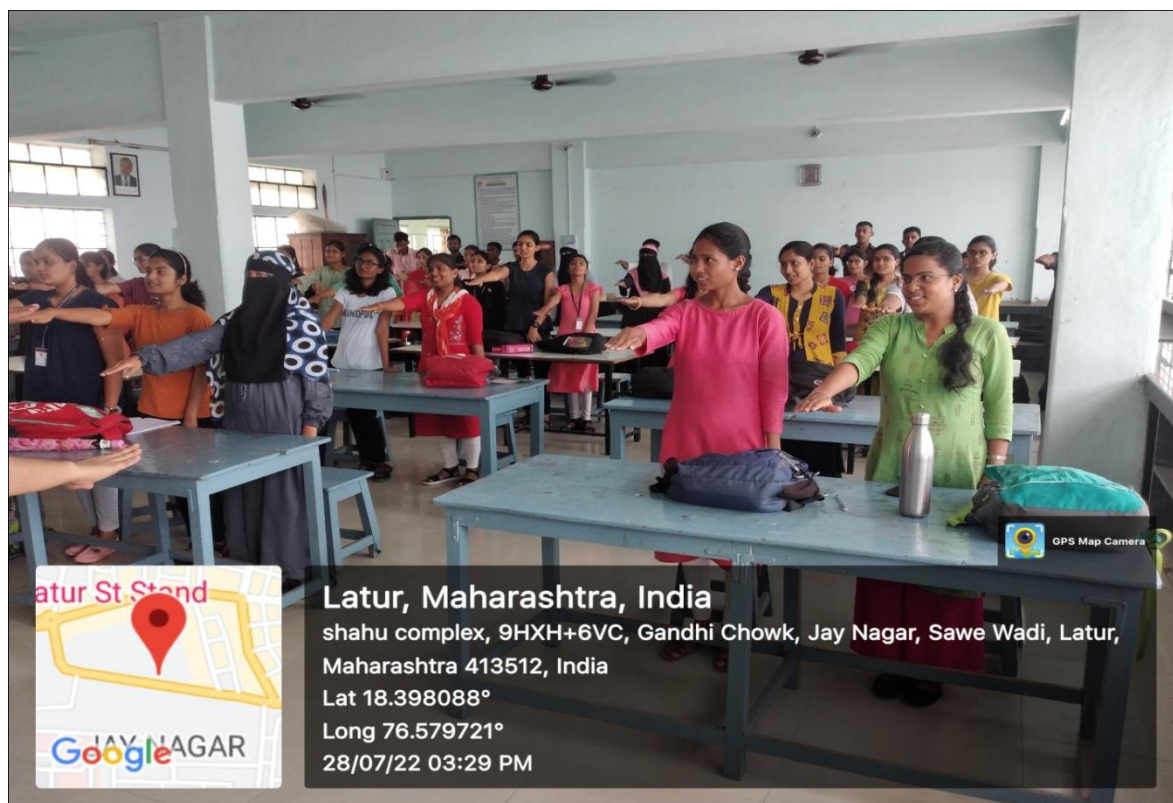
Students while taking Pledge to conserve the nature on the occasion of World Nature Conservation Day