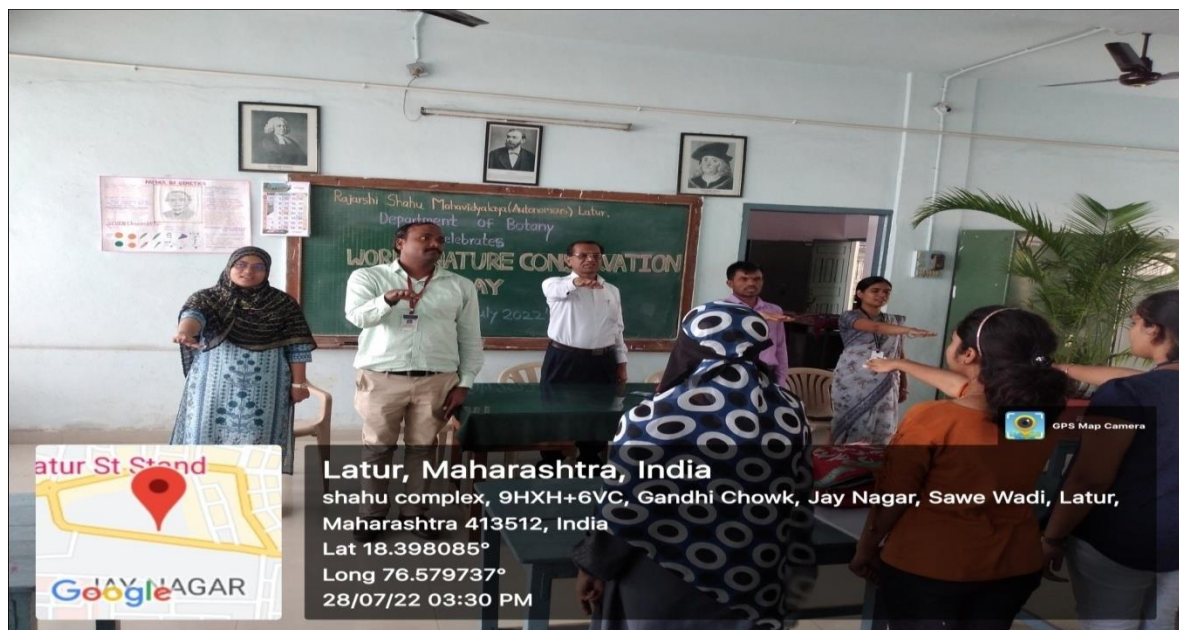
While having Pledge to conserve the nature on the occasion of World Nature Conservation Day