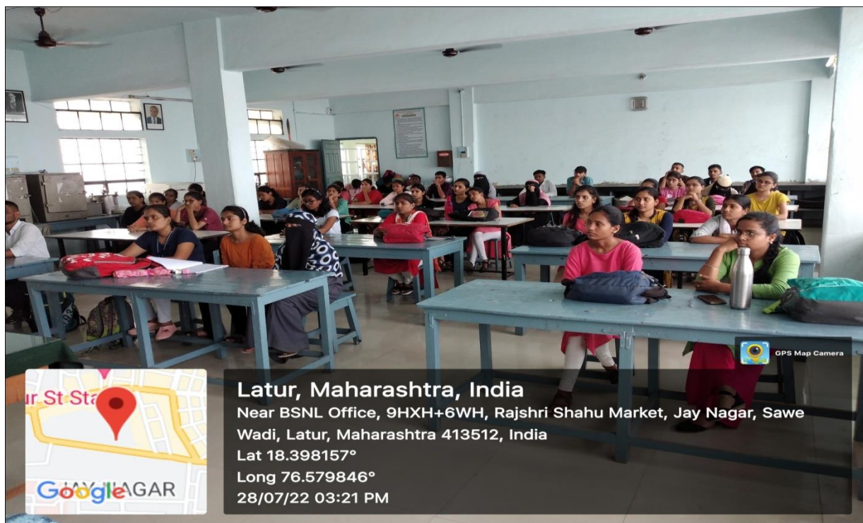
Participants involved in Celebration of World Nature Conservation Day