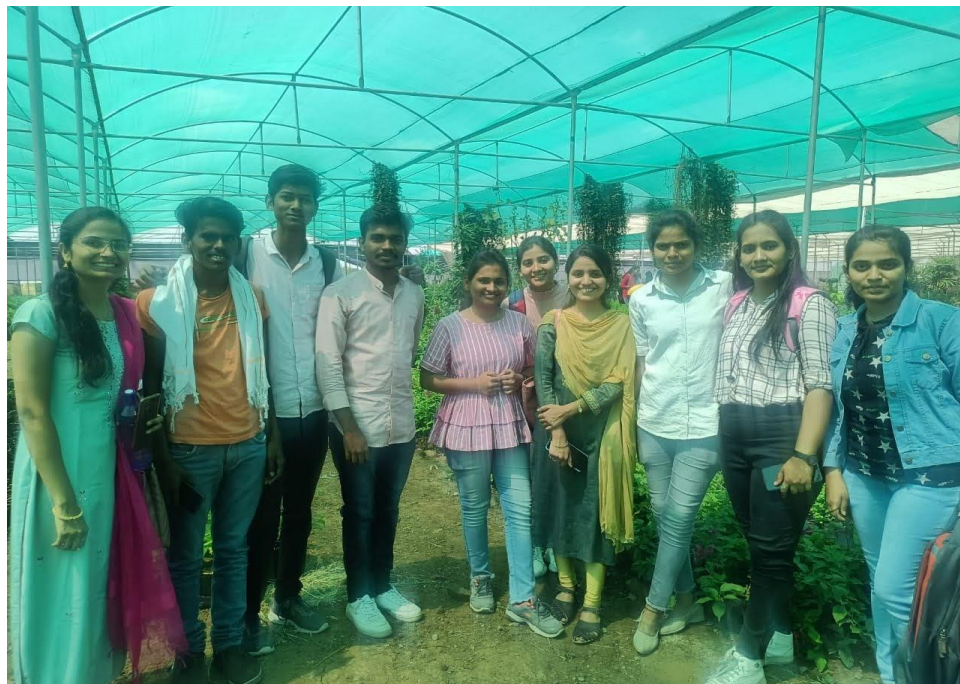
The faculty and students at green house of nursery.