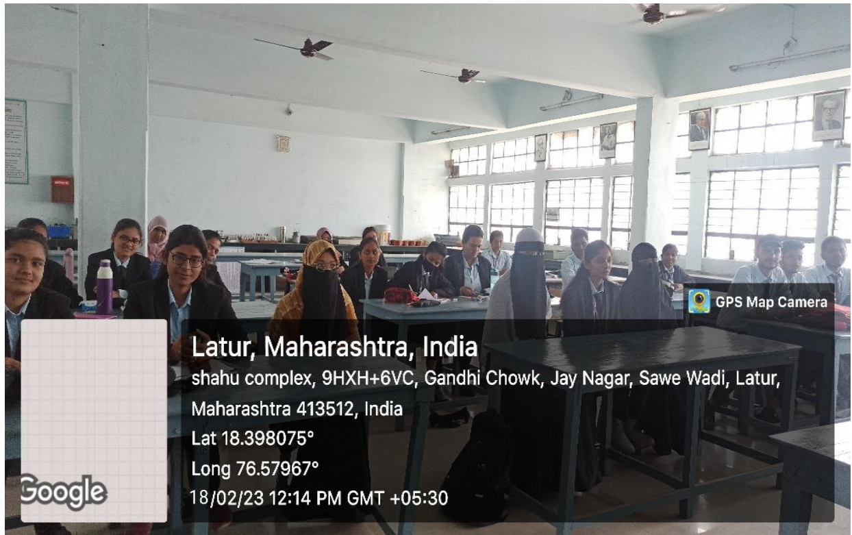
Participants involved in Orientation Program on Landscaping