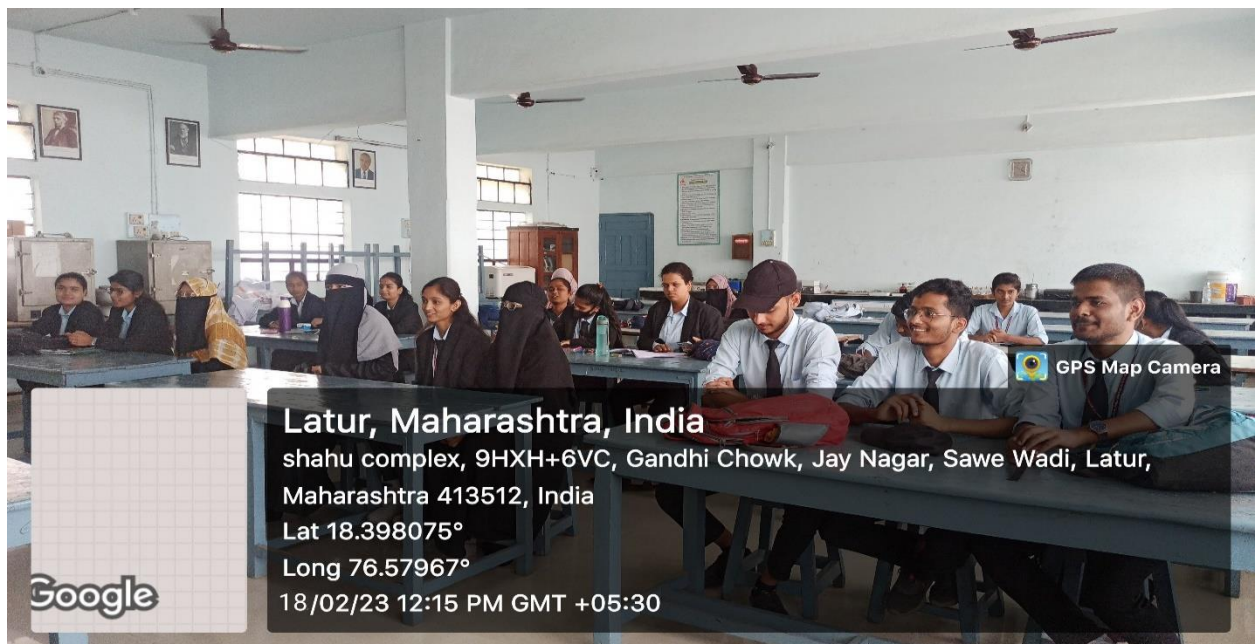
Participants involved in Orientation Program on Landscaping