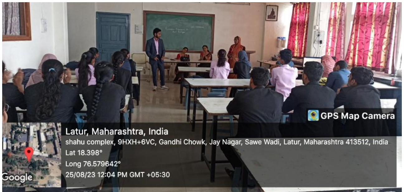
Students introducing the Guest