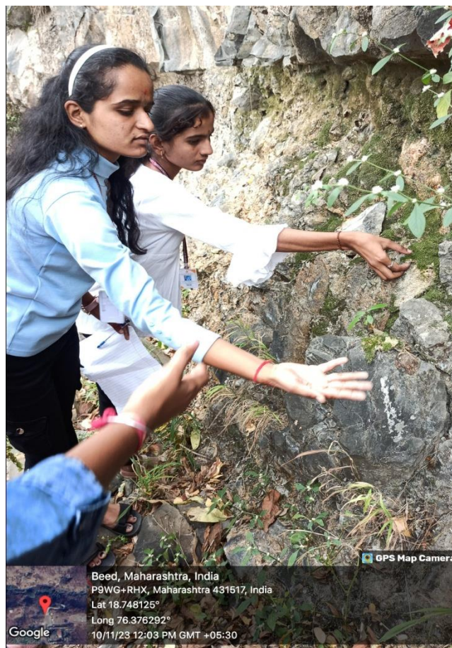
Students while collecting samples