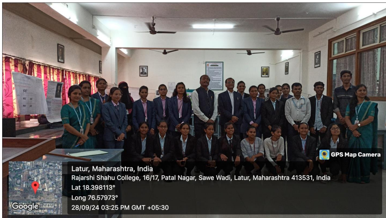
Participants and staff of Botany department on the occasion of Birth Anniversary of T. H. Morgan.