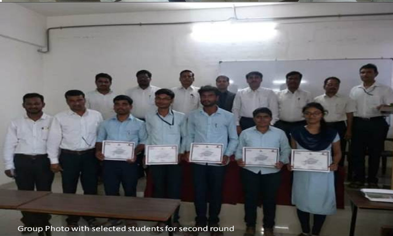
Group Photo with selected students for second round