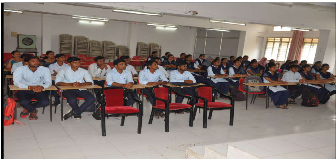
Students participating in two days workshop on Cheminformatics & drug Design