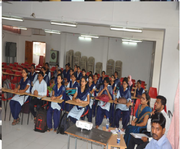
Active Participated in two days workshop on Cheminformatics & drug Design