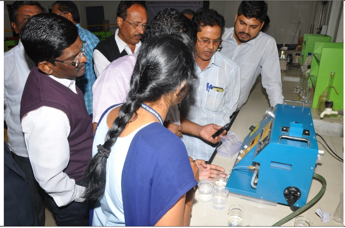
Practical Training to Delegates