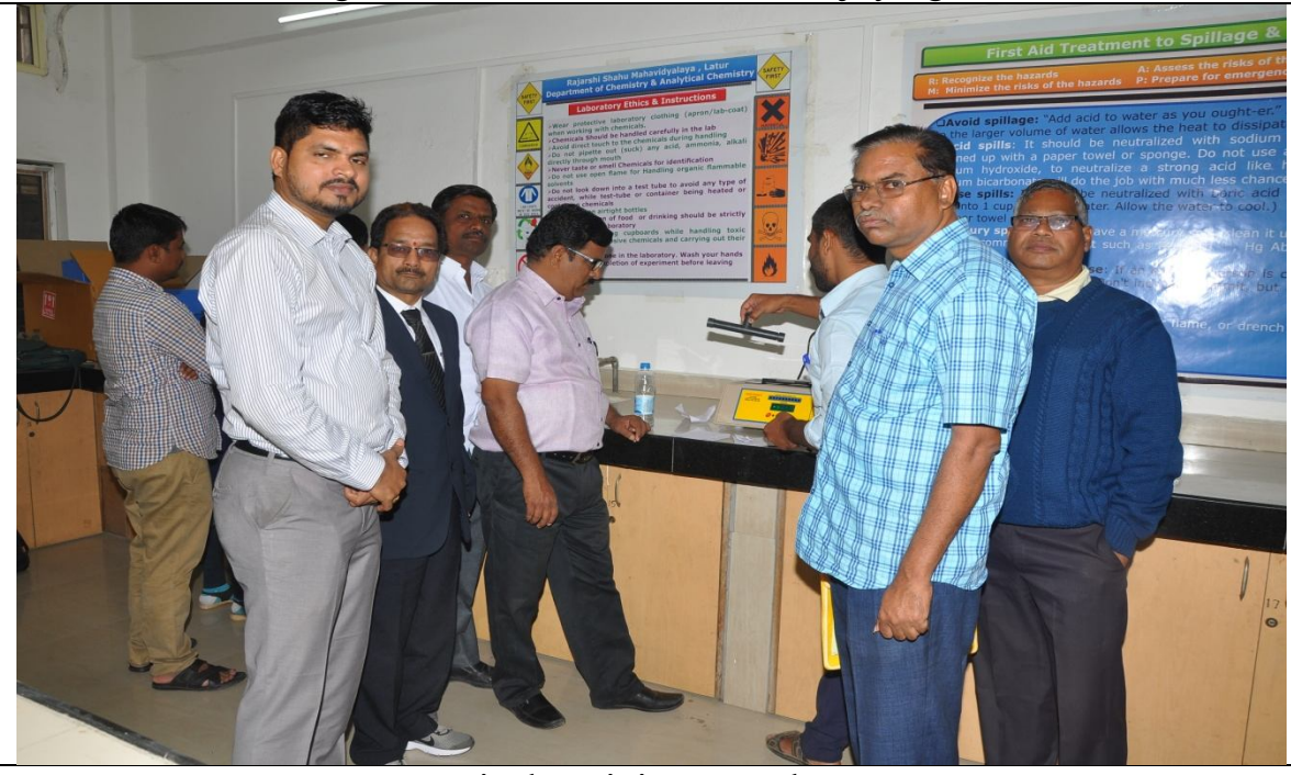
Practical Training to Delegates

Delegates and Resource Persons Enjoying Food