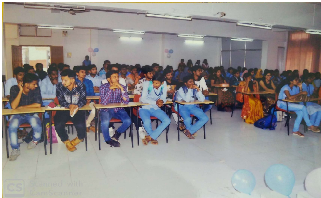
Students Participated in Inaugural Function of Dalton Association