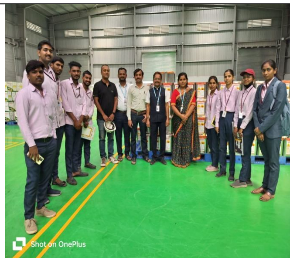
Refinery and packaging unit of octagon foods.