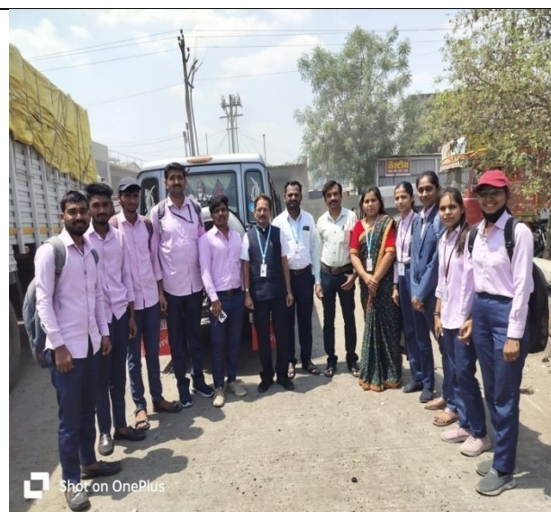
All Staff members and P.G. Students during Field visit.