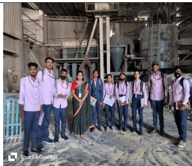
Cattle feed and pressed cake unit of octagon foods.