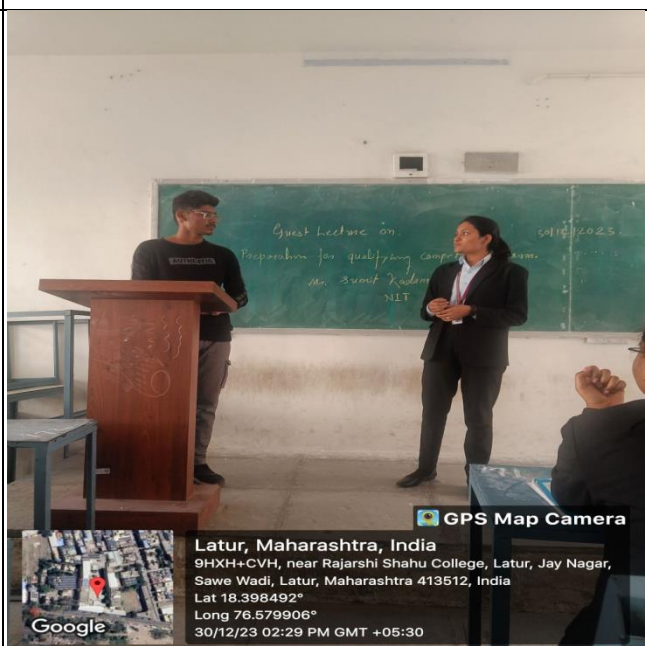
Student interaction with Resource person