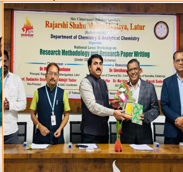
Felicitation of Resource Person by the Principal