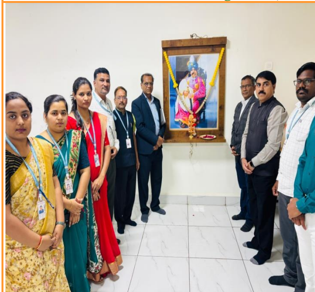
Lamp Lighting Ceremony & Inauguration of the Program