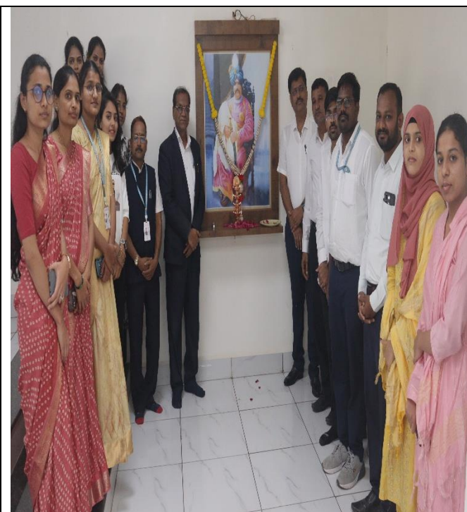
Chief Guest, Vice Principal, HoD and Other staff members Offering flowers during Inauguration.