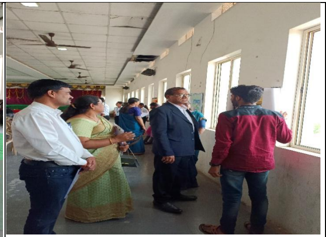
Students were explaining their posters to the chairperson and the experts.