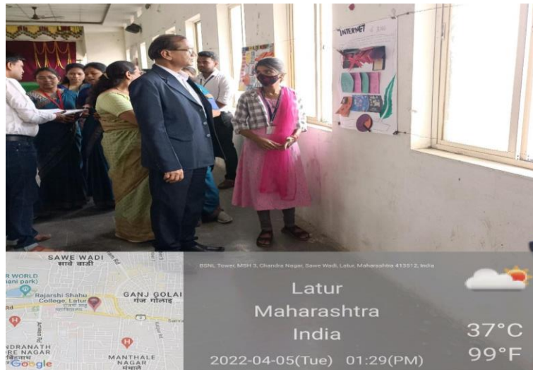
B. Voc. (CT) FY students interacting with the Chairperson