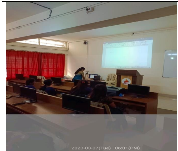
Faculties from Science, Commerce and Arts attending the training program