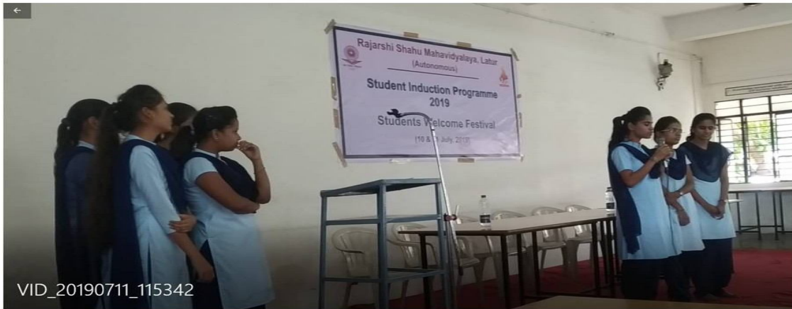
"Group Activity": Students representing story prepared by them.