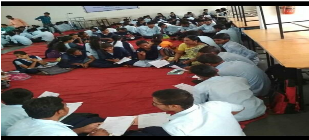
Students with their respective mentors performing group activity