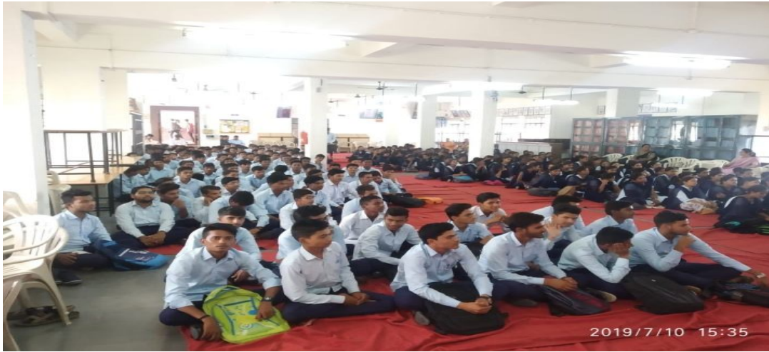
Students attending the programme