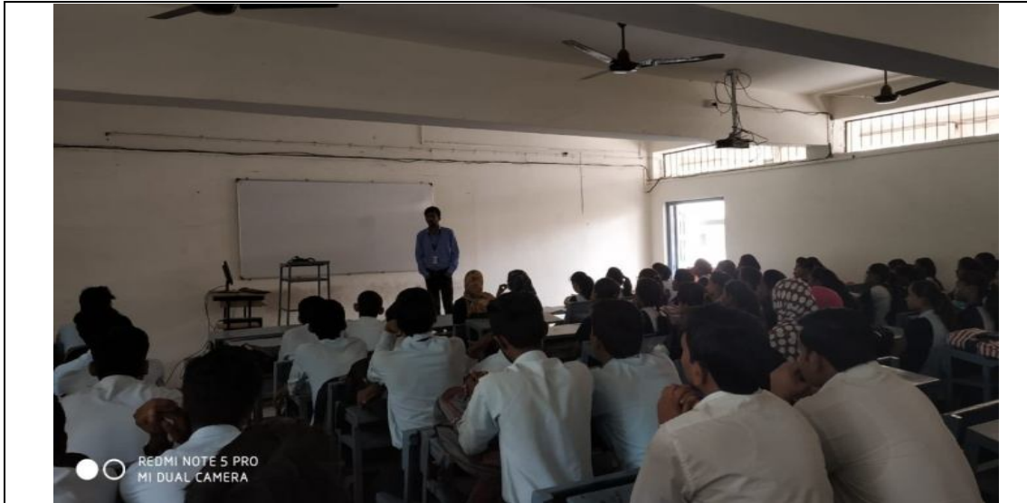
Students attending the guest lecture

Nyc Head Dept. of Information Technology R.S.M. (Autonomous), Latur HOD